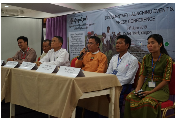
Press Conference during Chased by the Tide, Sittaung Riverbank Erosion Documentary Launching Event, Yangon

The project piloted and adjusted its approach in CBDRM since 2016. The internal analysis and