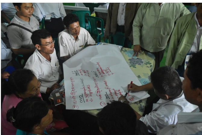
Participants from local communities discuss about riverbank erosion in affected villages in Bago Region during data collection for a disaster risk management workshop

As for DRM, this requires that the results of communities' CBDRM plans are considered in the township DRM plans, which thereafter inform district DRM plans and finally State/ Region and national DRM plans. This calls for a strong collaboration amongst the differ-