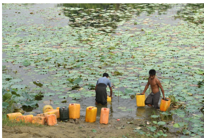
Water pond, Mi Lauk Village, Thanatpin Tsp

The final step in the CBDRM process of the GoMP is probably the most relevant one. It refers to linking DRM with development planning. Unfortunately, this is often hardly done and not part of the official CBDRM process. Experience shows that many measures of the